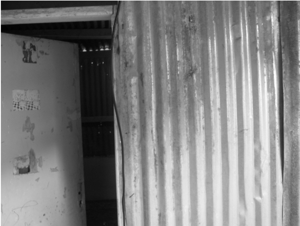
House with corrugated metal sheets in Jal el-Bahr, March 2005, © AI

ceilings. They provide little protection from the elements, letting in both rain and wind, and they become excessively hot during the summer. In the Nahr el-Bared camp near Tripoli, a group of three families, totalling 11 people, who lived together in one structure there prior to the battle in the camp in 2007, told Amnesty International that one of their babies had died in the summer heat after being left in the main room.