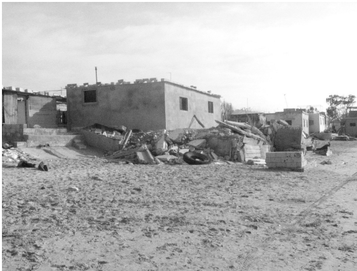
Houses in Jal el-Bahr "gathering", near Tyre, March 2005