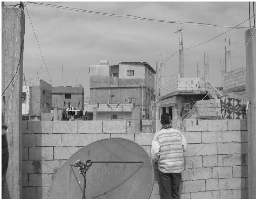
Rooftops in Ein el-Hilweh Palestinian refugee camp in Sidon, March 2005