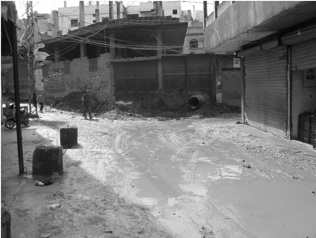
Street flooded with water due to poor drainage system in Nahr al-Bared camp in Tripoli, north Lebanon, March 2005

war of 1948 3 . They constitute one of the world's most long-established refugee populations and they remain in a form of limbo. They have virtually no prospect in the foreseeable future of being allowed to return to their lands and homes located primarily in what is now Israel, and to a much smaller extent in the Israeli-Occupied Palestinian Territories (OPT), even though they have a well-established right to return under international law. They also remain subject to various restrictions in the host country, Lebanon, which places them in a situation akin to that of second class citizens and denies them access to their full range of human rights, even though most of them were born and raised in Lebanon. Thousands have been further displaced even while in exile in Lebanon: some 30,000 remain displaced by the May-September 2007 clashes between the Fatah al-Islam armed group and Lebanese armed forces at the Nahr al-Bared camp. Just over half – some 53 percent - of Palestinian refugees who live in Lebanon, reside in war-torn, decaying and poverty-stricken camps. The conditions for those living outside the camps in towns, “gatherings”, villages and rural areas, are also poor.