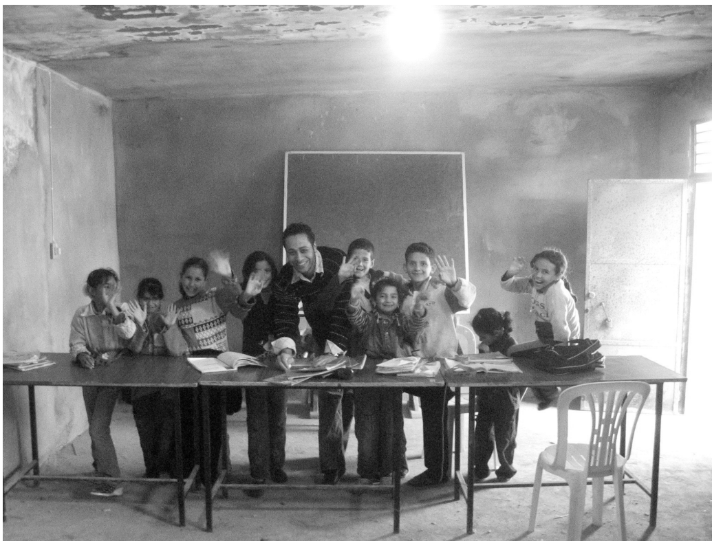
Children and their teacher at a community school in the Nahr al-Bared refugee camp, March 2005

“When I dropped out of school I learned butchery; I worked with a Lebanese for seven years outside the camp. I used to get LL100,000 per week while a Lebanese who did the same job got LL250,000 even though I did the same job and better.”