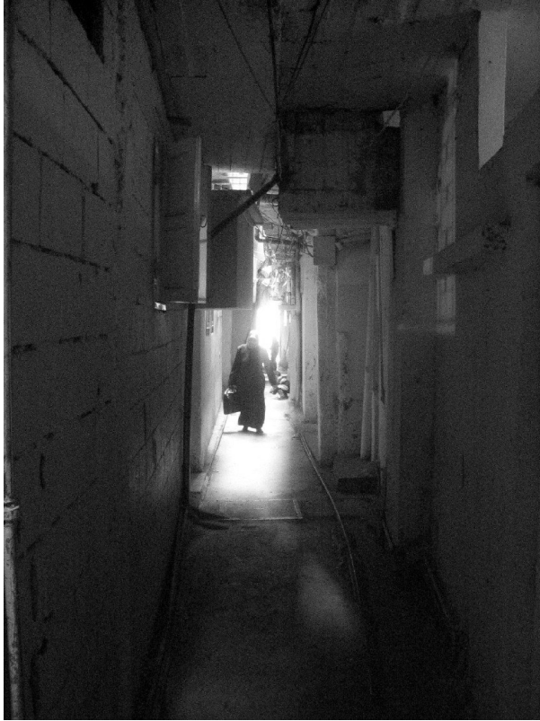
Building extensions blocking out the sunlight in Ein el-Hilweh's alleyways, March 2005