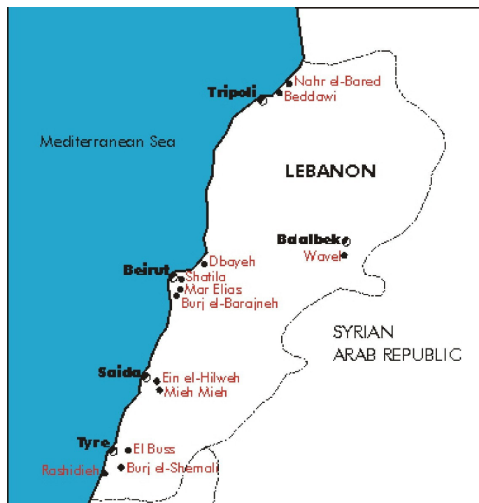
UNRWA Lebanon refugee camps