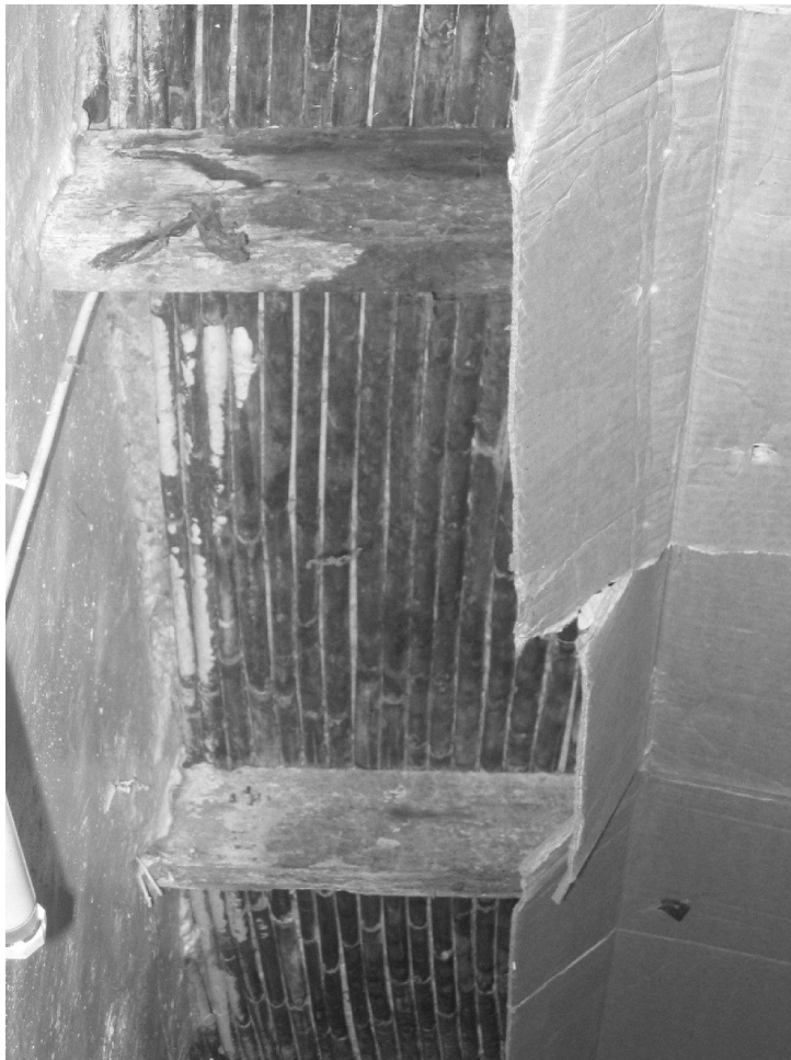
Roof coverings made of wood and sticks and cardboard in el-Maachouk camp, March 2005

“[My parents’] house has one room where the ceiling is made of corrugated metal and the ceiling in the other room is made of bamboo/wood sticks and on top of them mud. To use bricks in the ceiling instead we need permission from the local authority. The local authority does not give permission. We could go to the governorate but it does not give permission either. I built [the wall of] a small room in 2003. The police came and pulled it down and I had to pay a LL230,000 fine.”