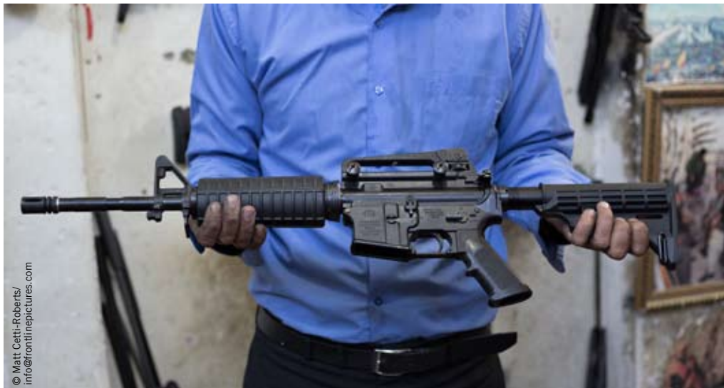
A Kurdish gunsmith holds a US-made M16A4, previously in the possession of the Iraqi army, and later IS, after the weapon was converted in to an M4 carbine-type rifle. Erbil, September 2014.

The main rifle type used by IS is the AK (Avtomat Kalashnikov) family of automatic rifles, as well as close copies and derivatives, with a bias towards the Russian and Chinese types that have been the staple of the Iraqi army for decades. Most of these weapons are decades old, though the more modern Russian AK-74M is in evidence, most probably looted from Syrian army stocks. IS forces have also captured US-manufactured small arms, including M16 assault rifles, along with Chinese, Croatian, Belgian and Austrian small arms. 9